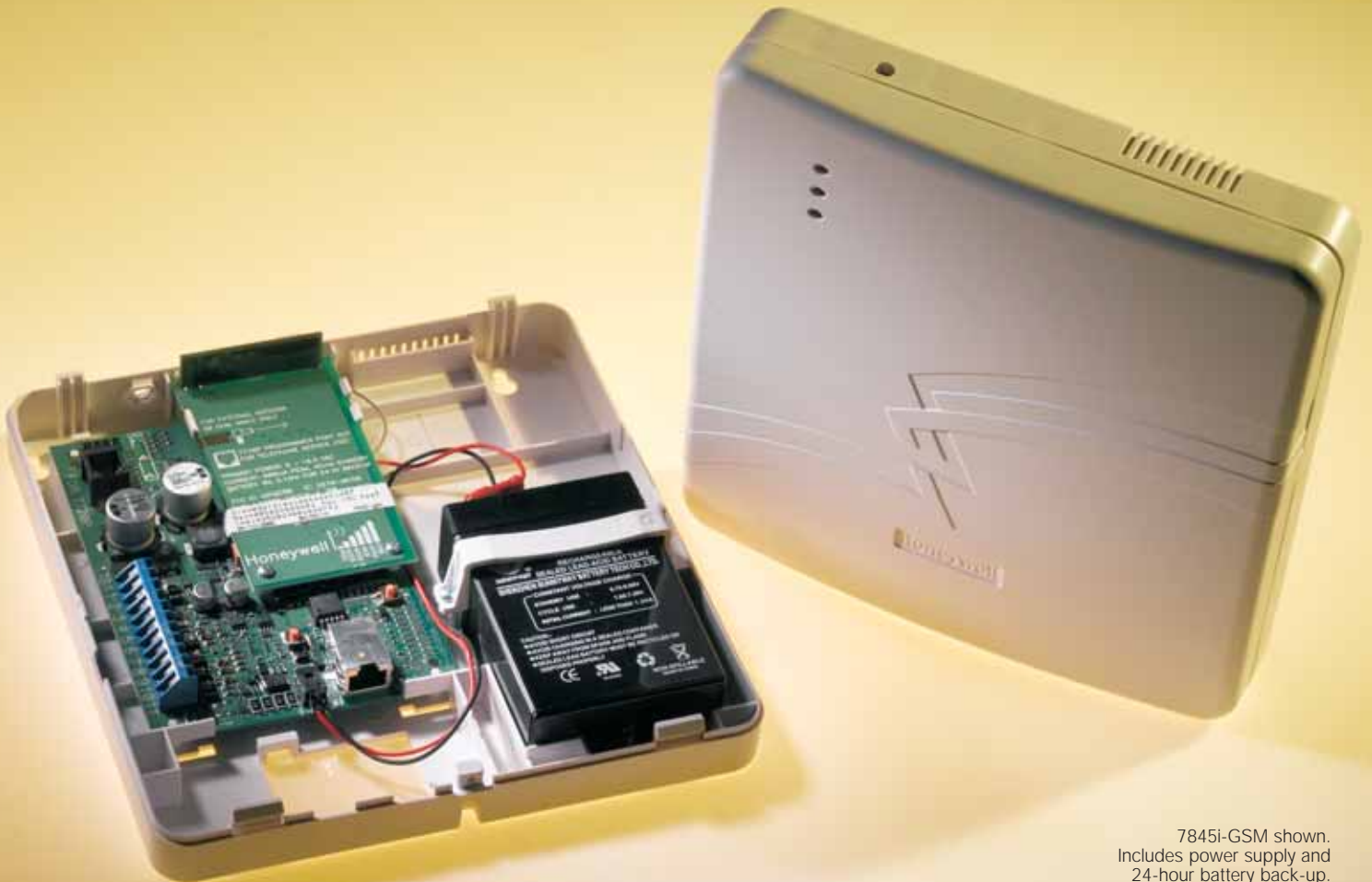
7845i-GSM shown. Includes power supply and 24-hour battery back-up.

The 7845i-GSM combines the Internet communicator with a GSM radio in one convenient device. Our exclusive Triple-Path communications solution delivers added reliability and an extra level of security. Triple-Path Technology provides three paths of communication using the Internet, GPRS, and SMS. The Internet is the primary and least costly way to communicate. Should the Internet be unavailable, the unit can communicate using the GSM network.