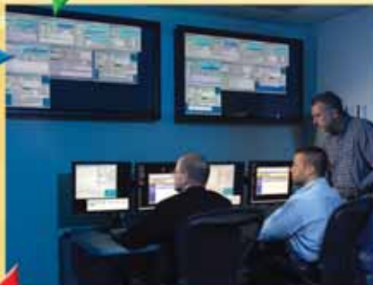
AlarmNet Network Control Center

The carrier identifies the GPRS or SMS signal as a Honeywell signal and manages this separately from all other signals on their network, to ensure that the signal is delivered to AlarmNet.